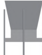
T1S-1818 Tier Square