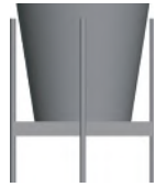
TC-1816 Tapered Cylinder