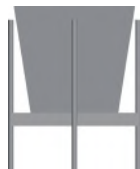
EUSQ-15 European Square