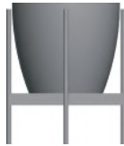
O1C-1815 Optimum One Round