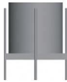
ECYL-1717 Earth Cylinder