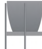
O1SQ-1815 Optimum One Square