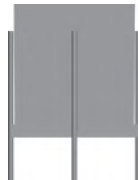
ETHC-181818 Earth Cube