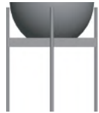
EBL-1808 Earth Bowl