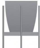
PHSQ-1717 Phoenix Square