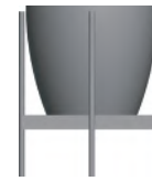
PHC-1815 Phoenix Cylinder