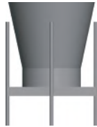
T1R-1818 Tier Round