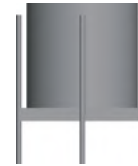
SCLCL-1716 StrongClay Cylinder