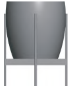
EU-16 European Cylinder