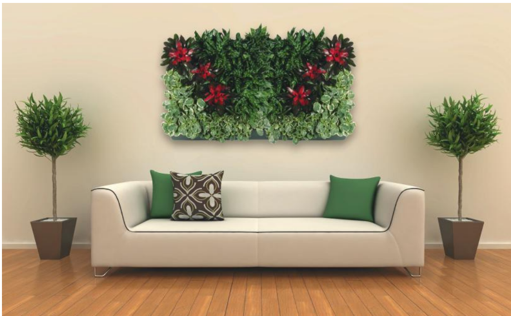
Two PP-3232's arranged horizontally