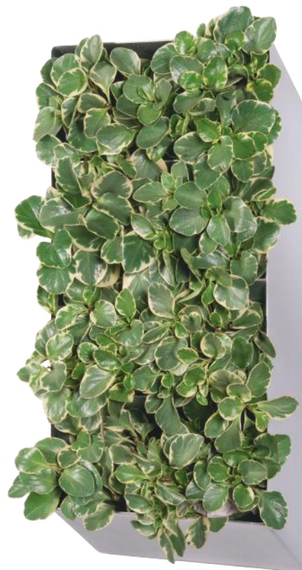
Available in 42 finishes

Simply add 3-4 wicked plants to each shelf and fill each shelf with water. Watering cycle is normally 1-2 weeks.