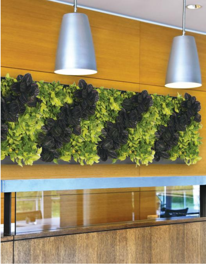
Four PP-3232's arranged horizontally