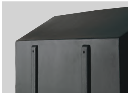
Rails on back allow for air circulation